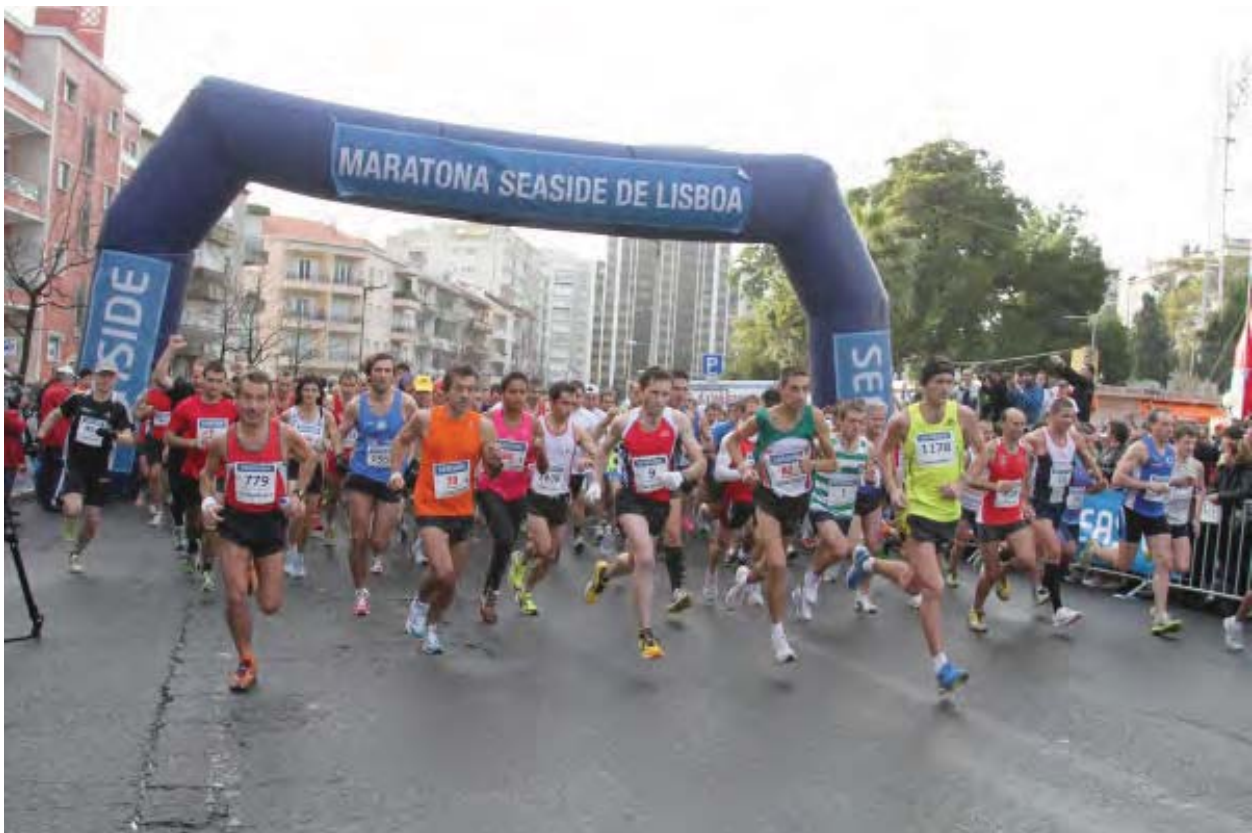
A partida da maratona e dos atletas da estafeta